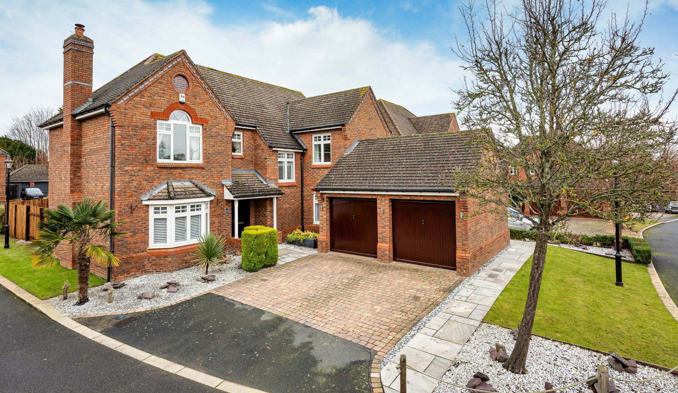
10 The Moat House, Eardington, Bridgnorth, Shropshire, WV16 5LE